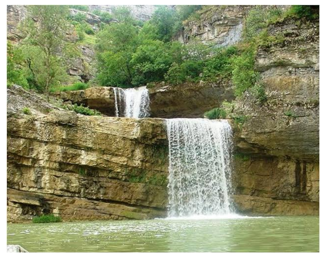
Figure 1. Mirusha Waterfalls- one of the most beautiful protected site network in Kosovo

The 1986 Law on national park "Sharr Mountain" in December 2012 was replaced by a new law on national park "Sharri" (Law on national park "Bjeshket e Nemuna" 2011), which extends protected areas from 39,000 ha as it was in the previous law, to 53,469 ha with the description "territory with natural values and rarities, preserved forests, the high number of important forest and other ecosystems, with high number of endemic and relics species, with rich geomorphologic, hydrological features, and with scientific, cultural, historic, landscapes, sports, tourism and recreation and activities that contribute to economic development with ecological criteria". The territory of "Sharri" national park lies in south of