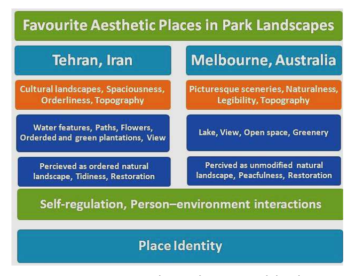
Figure 1: Favourite aesthetic places in park landscapes

aesthetic values for the respondents. They also afford restorative experiences that lead to emotion and self-regulation processes and develop place identity (see Figure 1). However, crowded spaces and lack of 'tidiness', 'orderliness', and 'natural elements' are aspects that create the least valued landscape scenes in terms of aesthetic and make them unfavourable.