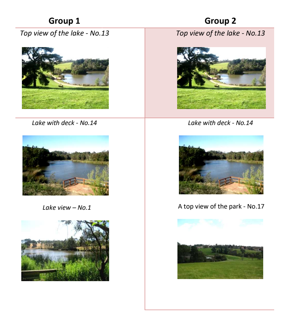
Table 5: Favourite aesthetic places in Ruffey Park landscapes, identified by two groups of the respondents

our environment (Kaplan & Kaplan 1989). Water, likewise, in the landscape is often used as an indication of naturalness (Ode et al. 2008) and as an important aspect of restorative environments (Ode et al. 2008; Hartig et al. 2003; Kaplan & Kaplan 1989). Respondents' emphases on the 'open space', 'view', 'naturalness', and 'peacefulness' support the legibility, coherence, and naturalness landscape characters in Ruffey Park. However, the general terms of 'open space', 'natural' and 'peaceful' might mean different things in Iranian culture due to various reasons, such as specific characteristics of green spaces, climate, and ecology in Iran, as well as the Iranian cultural landscape and socio-cultural aspects. Therefore, the naturalness and open space which are seen in Ruffey Park and Iran's parks, and the sense of restoration which is perceived in these two contexts may be different.